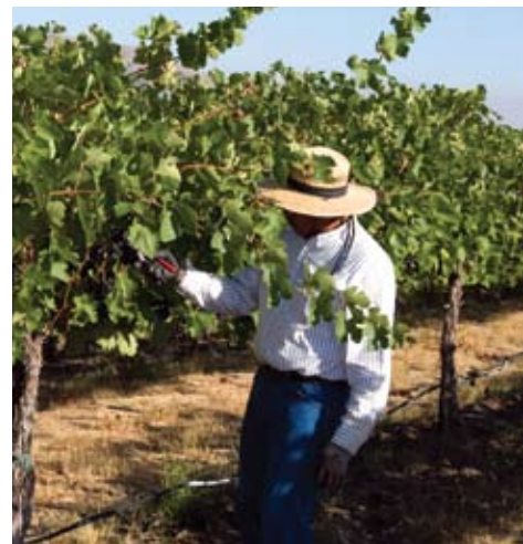
Klipsun Vineyard focuses on sustainable vineyard practices and hasn't applied an herbicide in twenty years.