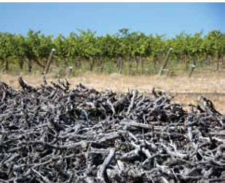
After a freeze in 1986, Chardonnay vines were pulled out and Syrah planted, but the Chardonnay wood pile remains.

That's our Chardonnay over there, that wood pile.