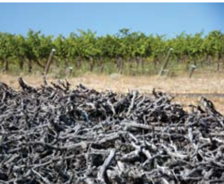
After a freeze in 1986, Chardonnay vines were pulled out and Syrah planted, but the Chardonnay wood pile remains.

That's our Chardonnay over there, that wood pile.